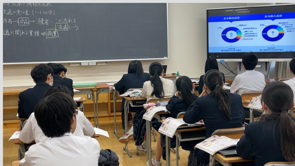
A class in progress