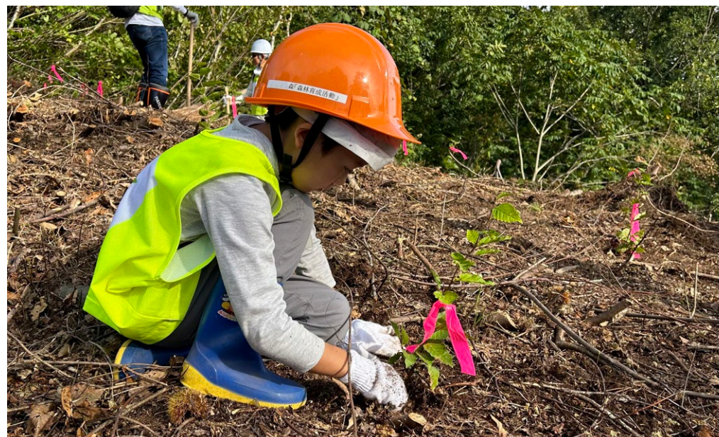
Tree planting in action