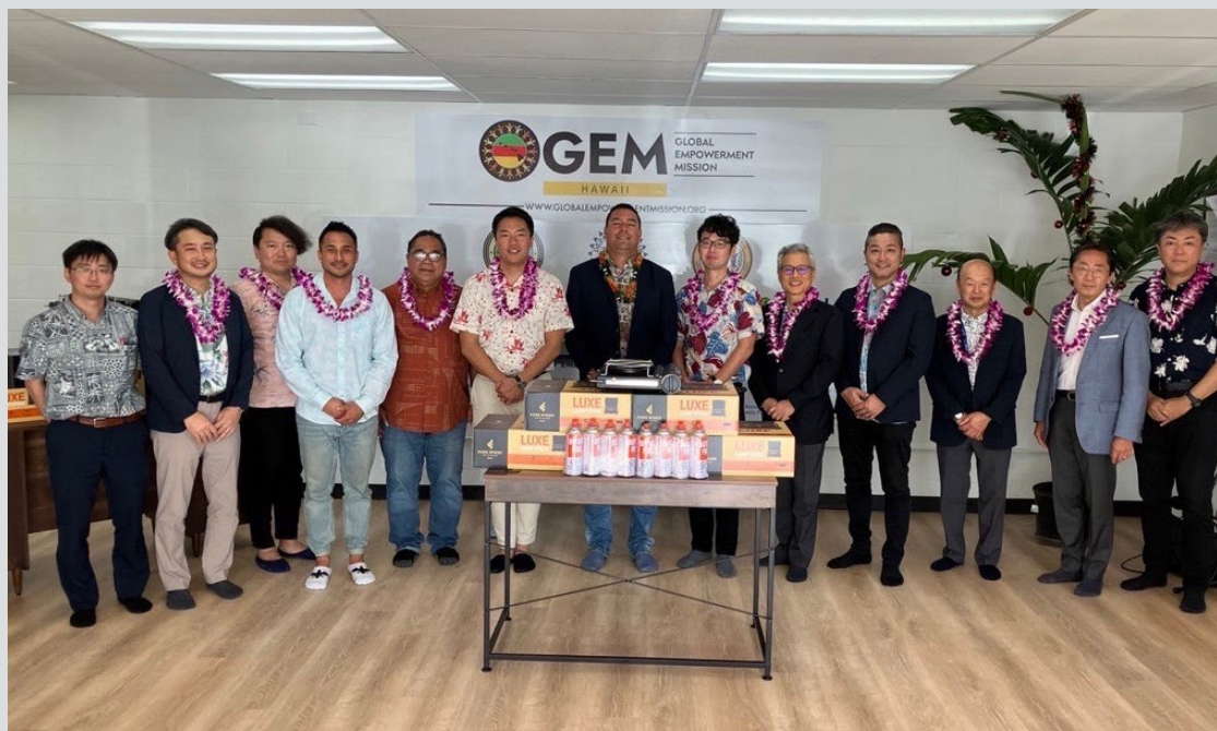
Gas cartridge stove handover ceremony

Nippon Express USA, Inc. provided free shipping and delivery of 1,000 gas cartridge stoves from Los Angeles to Maui for residents in the region who were impacted by a massive wildfire.