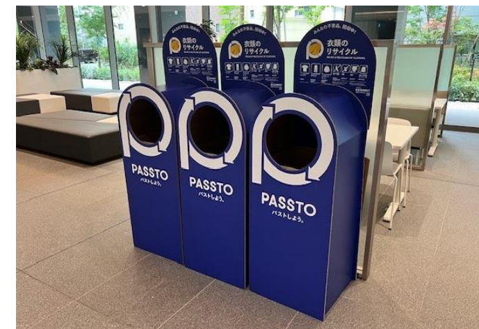
▲ Pilot test of PASSTO, a service provided by ECOMMIT, at the NX Head Office building