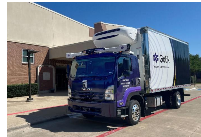
▲ An autonomous box truck from Gatik AI Inc.